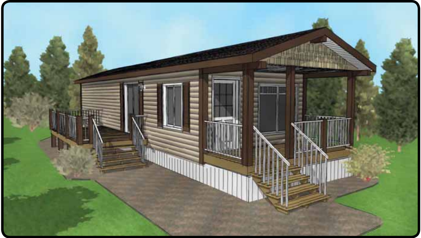
“The Riverview” 14' x 50', 616 sq. ft., 2FL-1B